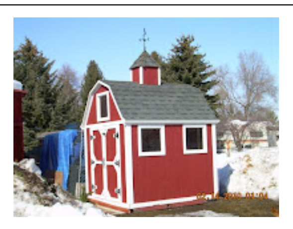
Kendall's Coop Even chickens need a fun place to live, right?

Fancy Builder was contacted by a retired Idaho couple who wanted a chicken coop, but not just any chicken coop. For the outside, they wanted nice-looking building that would be an enhancement to their property. They also wanted a sturdy wood floor that could handle being moved and a barn-look for the structure. For the inside, they wanted ten nesting boxes. Five on each side with identical nests on both sides of the coop so it could be separated down the middle.